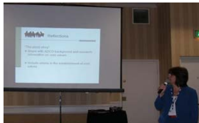
Alexis Yannick, Newhall SD "Implementing Core Values"