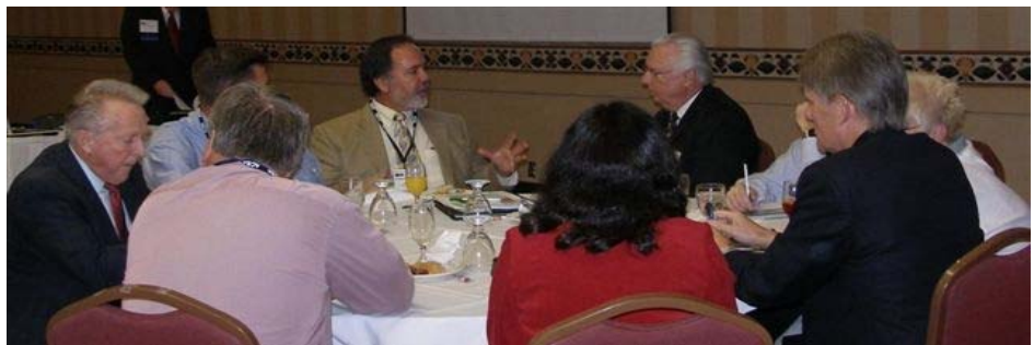
Participants exchanging information